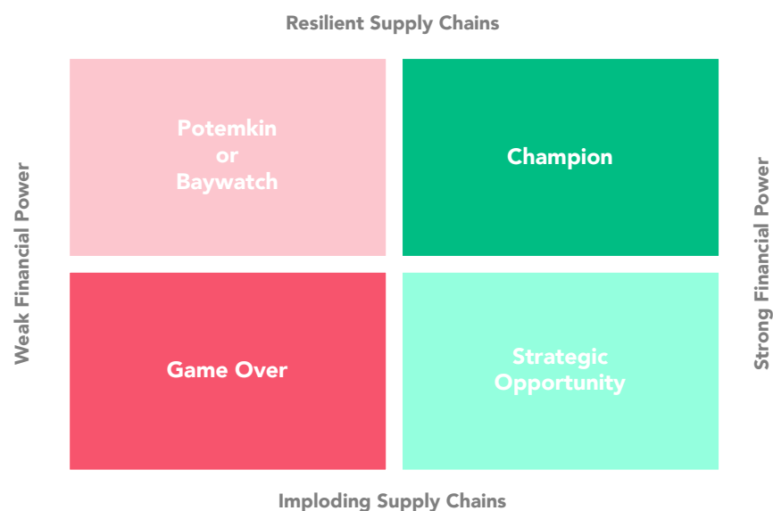
Figure 2: Four Corporate Scenarios

The corporate scenarios (Figure 2) look at the immediate business environment. It is assumed that corporate readiness in dealing with the immediate and long-term challenges of COVID-19 is characterized by two aspects: